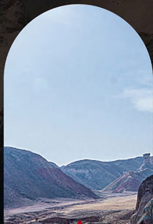
Other unpaved roads