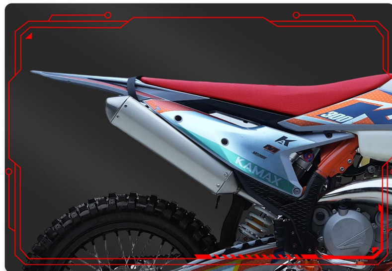
Enlarged aluminum alloy tail exhaust