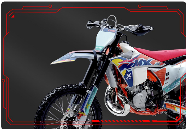
Tank guard plate