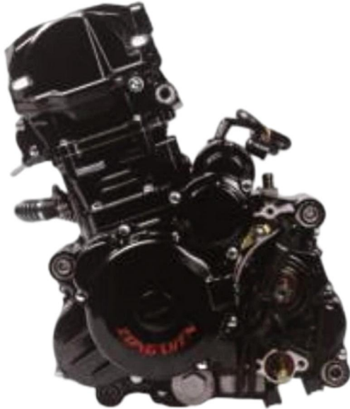
NB300 174 MM