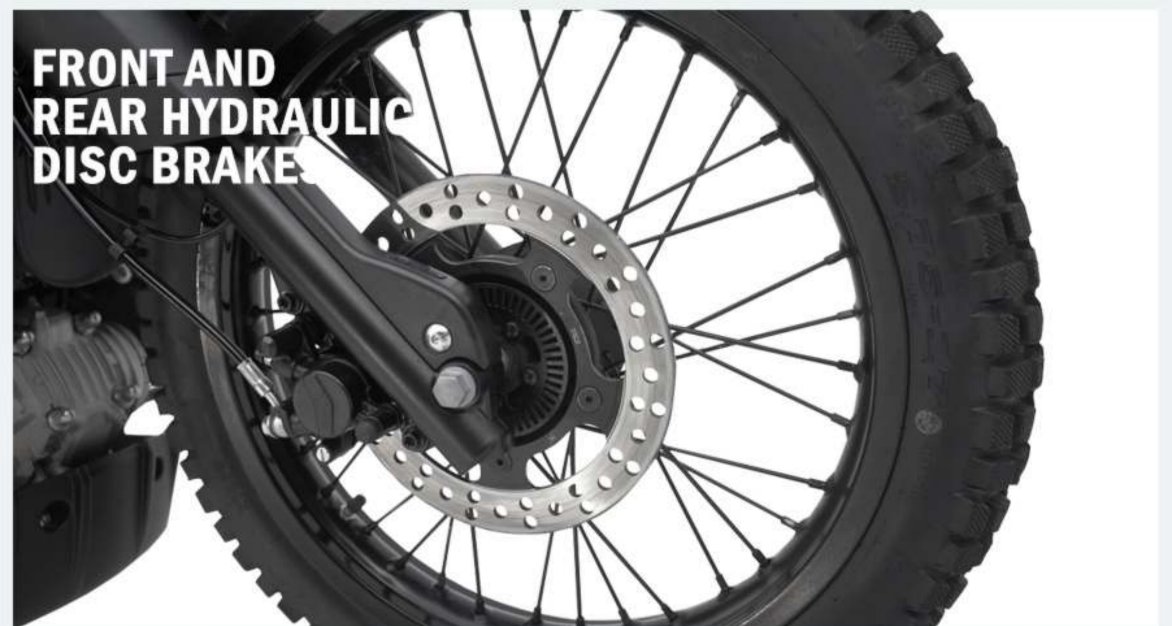
FRONT AND REAR HYDRAULIC DISC BRAKE