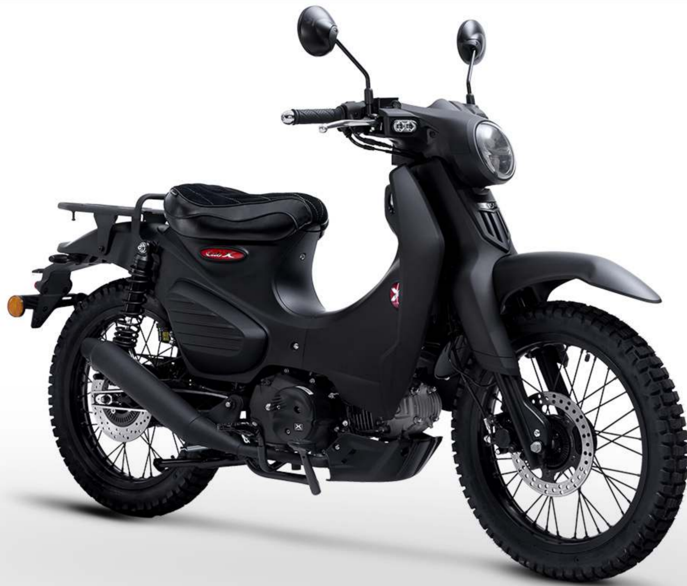
EASY TO PARK