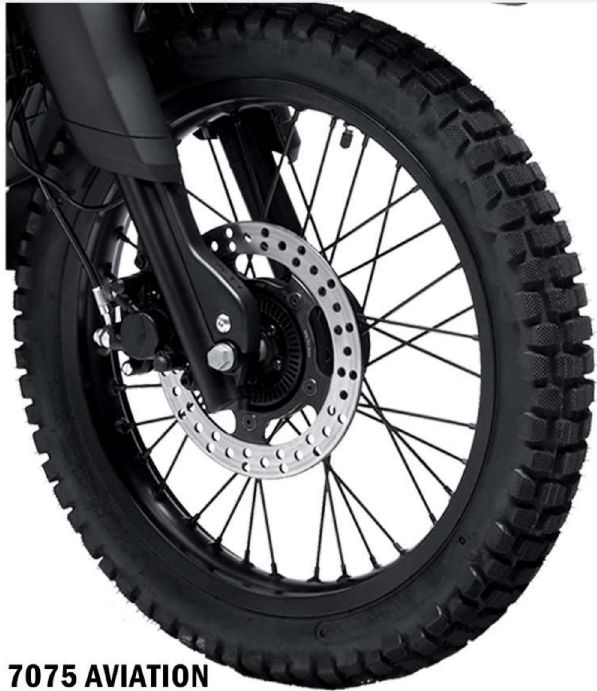
7075 AVIATION ALUMINUM ALLOY WHEEL RIMS