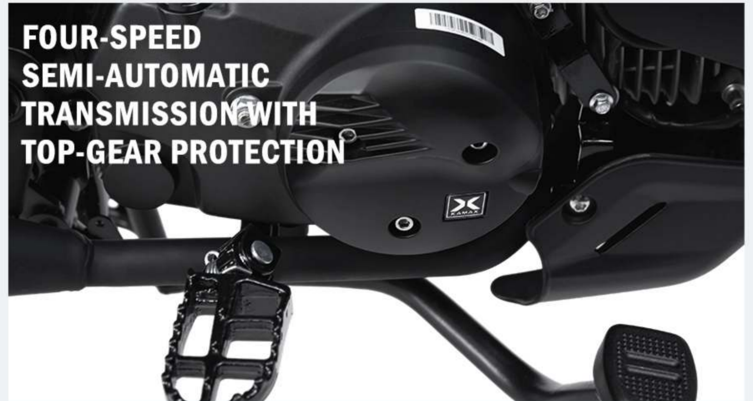
FOUR-SPEED SEMI-AUTOMATIC TRANSMISSION WITH TOP-GEAR PROTECTION