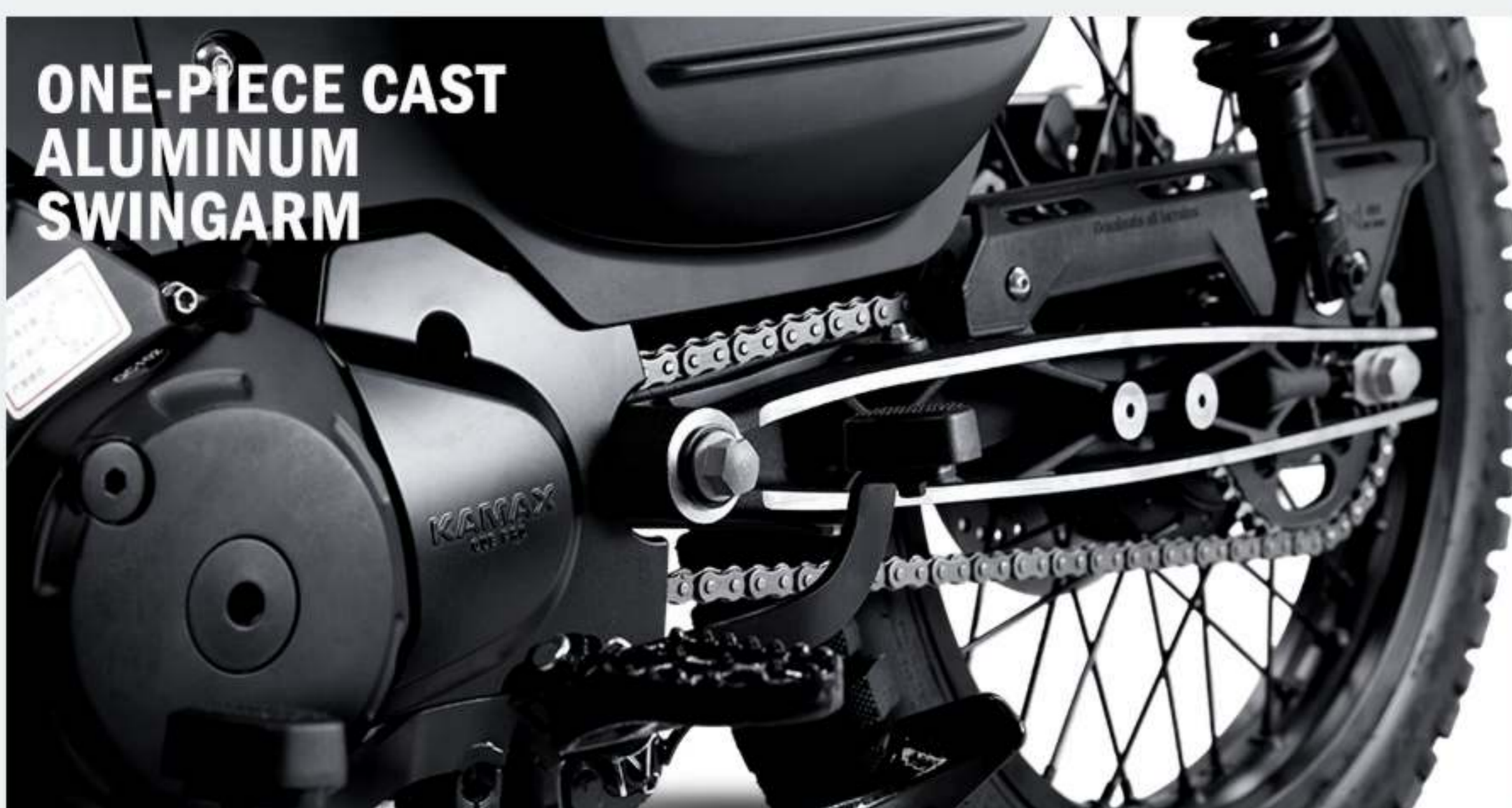
ONE-PIECE CAST ALUMINUM SWINGARM