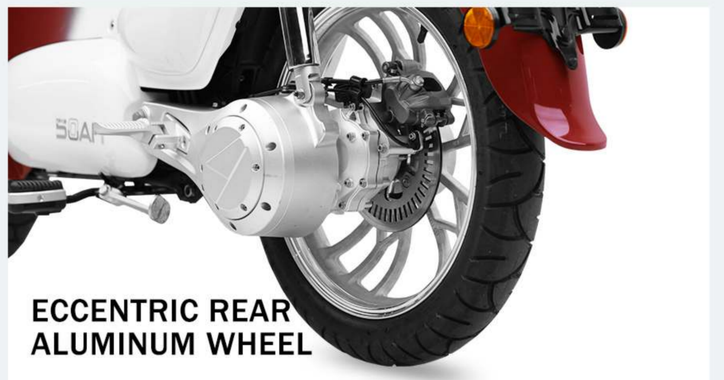
ECCENTRIC REAR ALUMINUM WHEEL