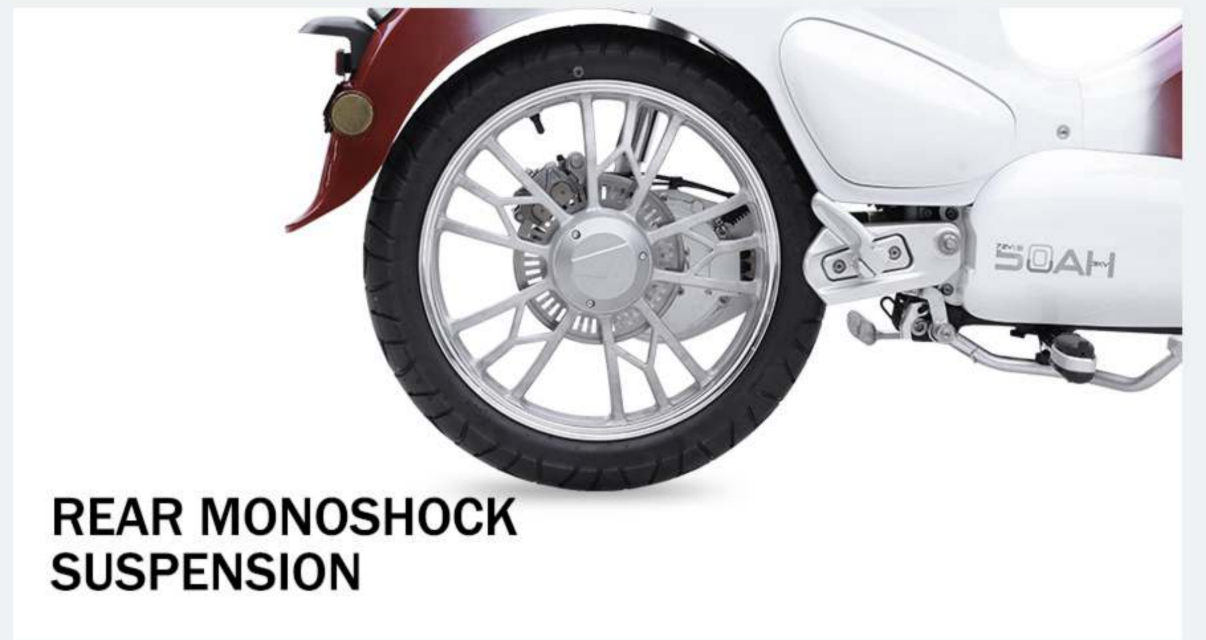
REAR MONOSHOCK SUSPENSION