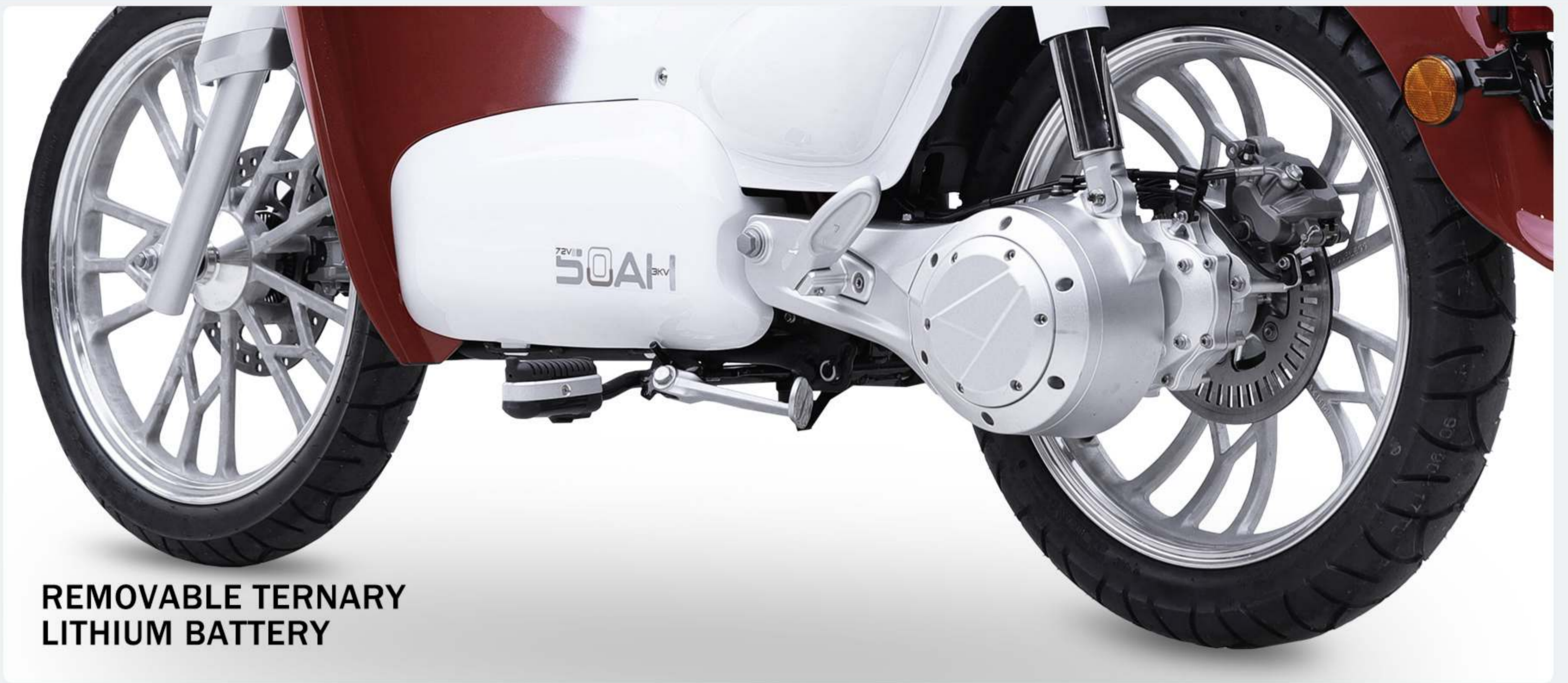
REMOVABLE TERNARY LITHIUM BATTERY