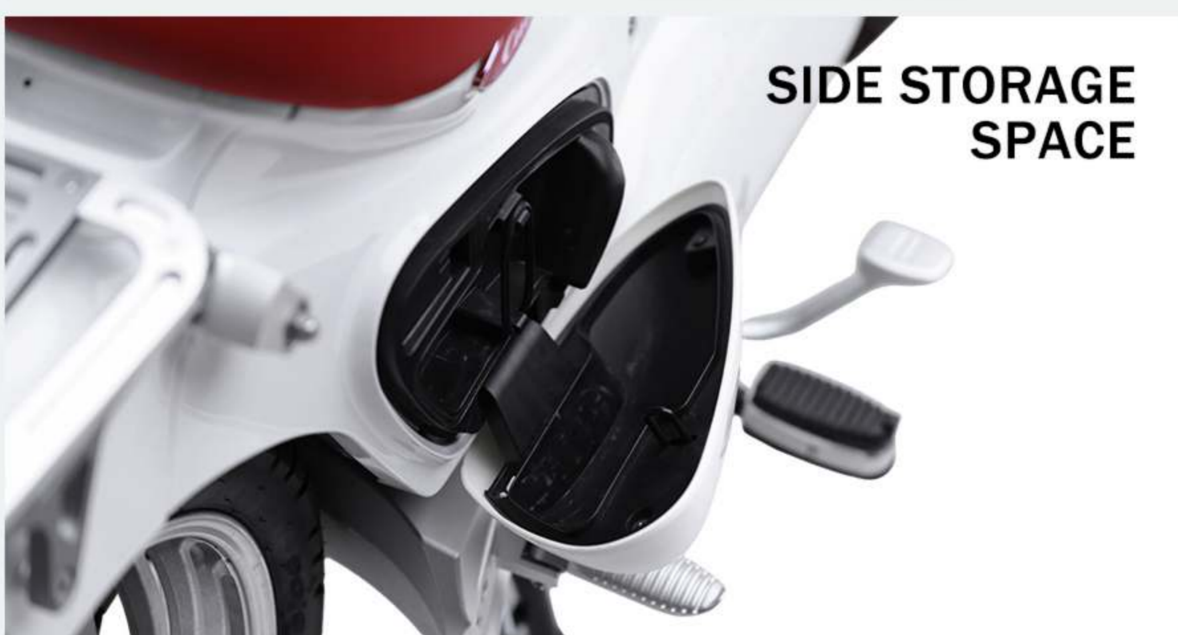
SIDE STORAGE SPACE