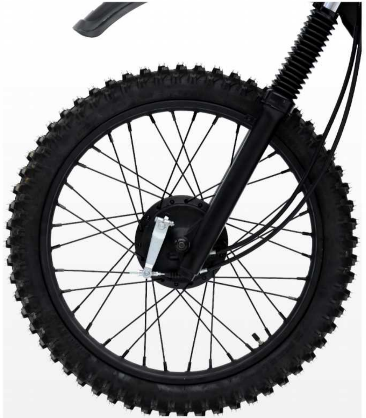
All-Terrain Off-Road Tires