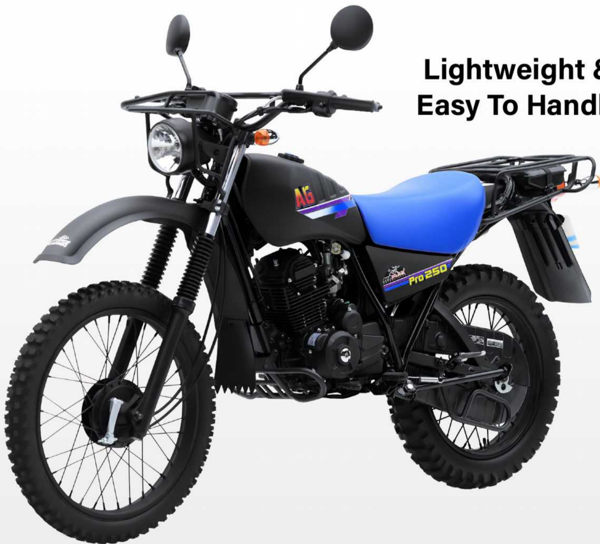
Lightweight & Easy To Handle