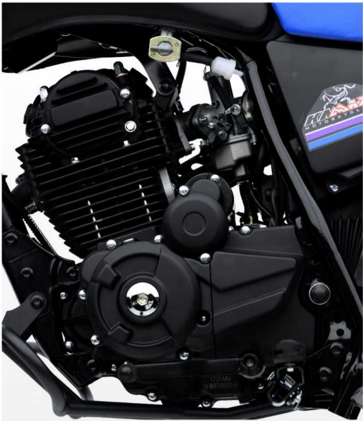
Option Engine AG200\AG250