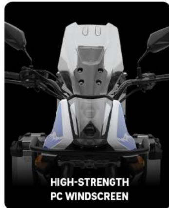
HIGH-STRENGTH PC WINDSCREEN