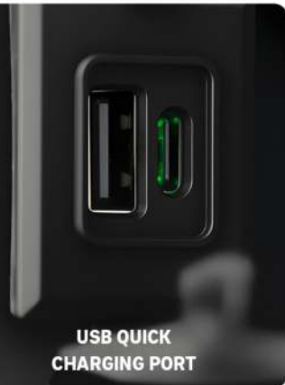
USB QUICK CHARGING PORT